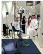
STG Group CEO with Bloomberg