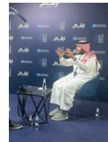
STG CMO with Argaam