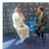
STG Group CEO with Bloomberg Asharq