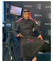
Saudi Exchange CEO with Arab News