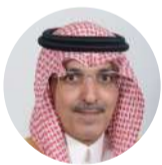
H.E. Mohammed Al-Jadaan Minister of Finance and Chairman of Financial Sector Development Program committee