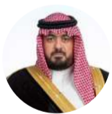
H.E. Faisal Al-Ibrahim Minister of Economy and Planning