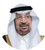
H.E. Khaled Al-Faleh Minister of Investment